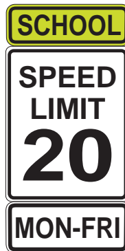
School Speed Limit Assembly (MUTCD S4-3) (MUTCD R2-1) (MUTCD S4-6)