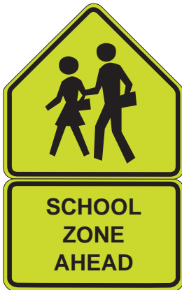
School Speed Limit Advance Warning (MUTCD S4-5)