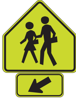
School Crosswalk Warning Assembly (MUTCD S1-1) (MUTCD W16-7p)